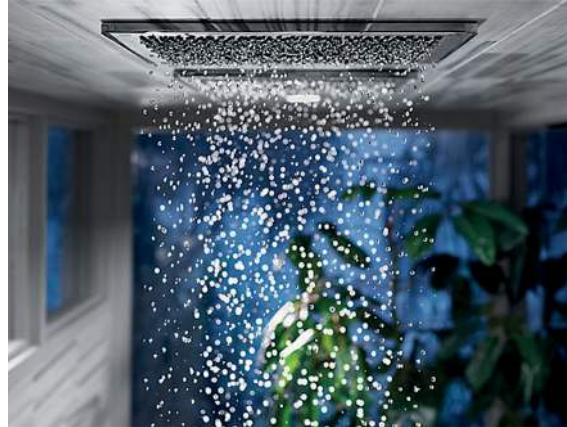
Figure 7: The Kohler Real Rain shower

Studying all the elements of a natural rain shower, from the varying sizes of the raindrops to the angles at which they fall, Kohler has created Real Rain, a showering experience that transports the user beyond the everyday home event. The shower is often a conversation starter.