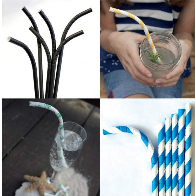
Figure 2: The Eco-Flex straw