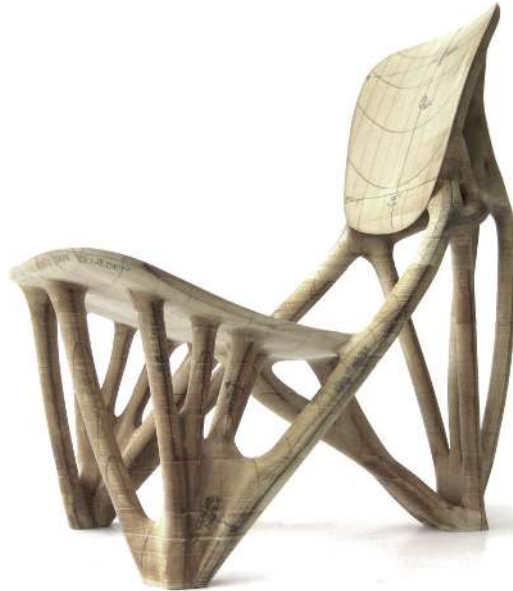
Figure 3: The paper bone chair