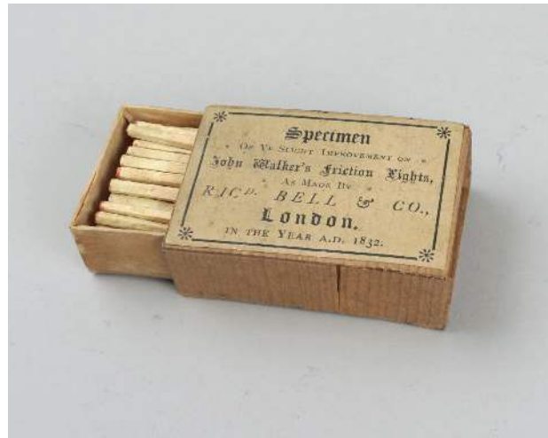
Figure 5: The “Friction Lights” match